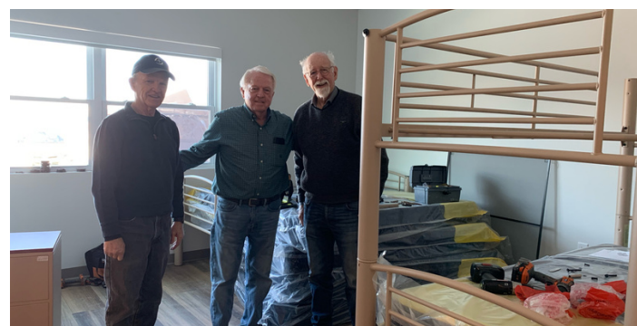
Volunteers set up the Waukesha Overflow in Jan 2021

For information about how to volunteer at the new Family Promise Community Shelter, visit www.familypromisewaukeshawi.org/become-a-partner .